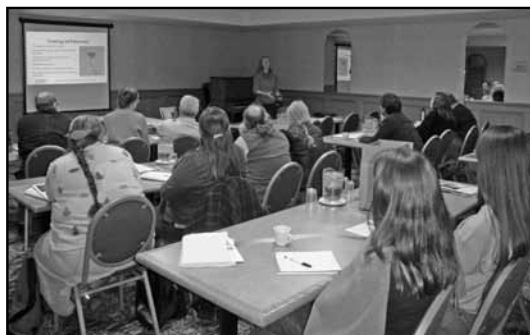
The Seed Sessions were amongst many well-attended presentations

In between the breakout sessions, we were able to visit with the many vendors, friends and neighbors and get some wholesome snacks. After lunch, we received positive messages from the offices of Senators Tester and Baucus and Representative Rehberg.