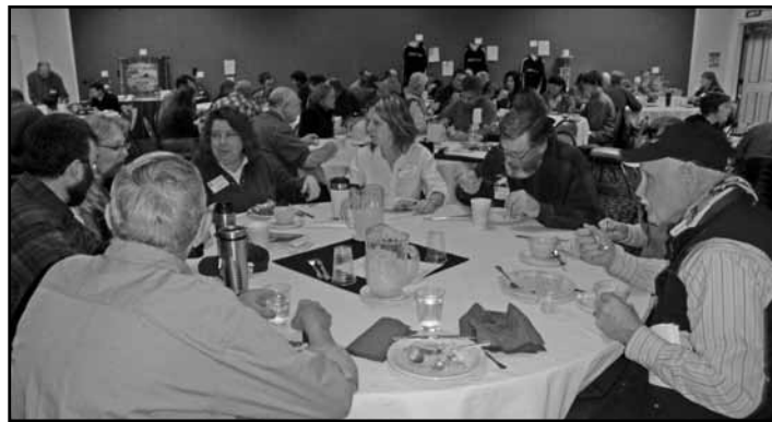
The MOA Conferences are always opportunities to meet and eat